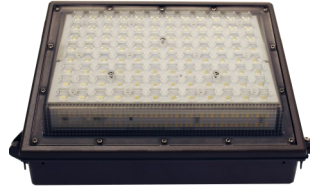
Bottom LED array ensures seamless coverage in proximity of the fixture